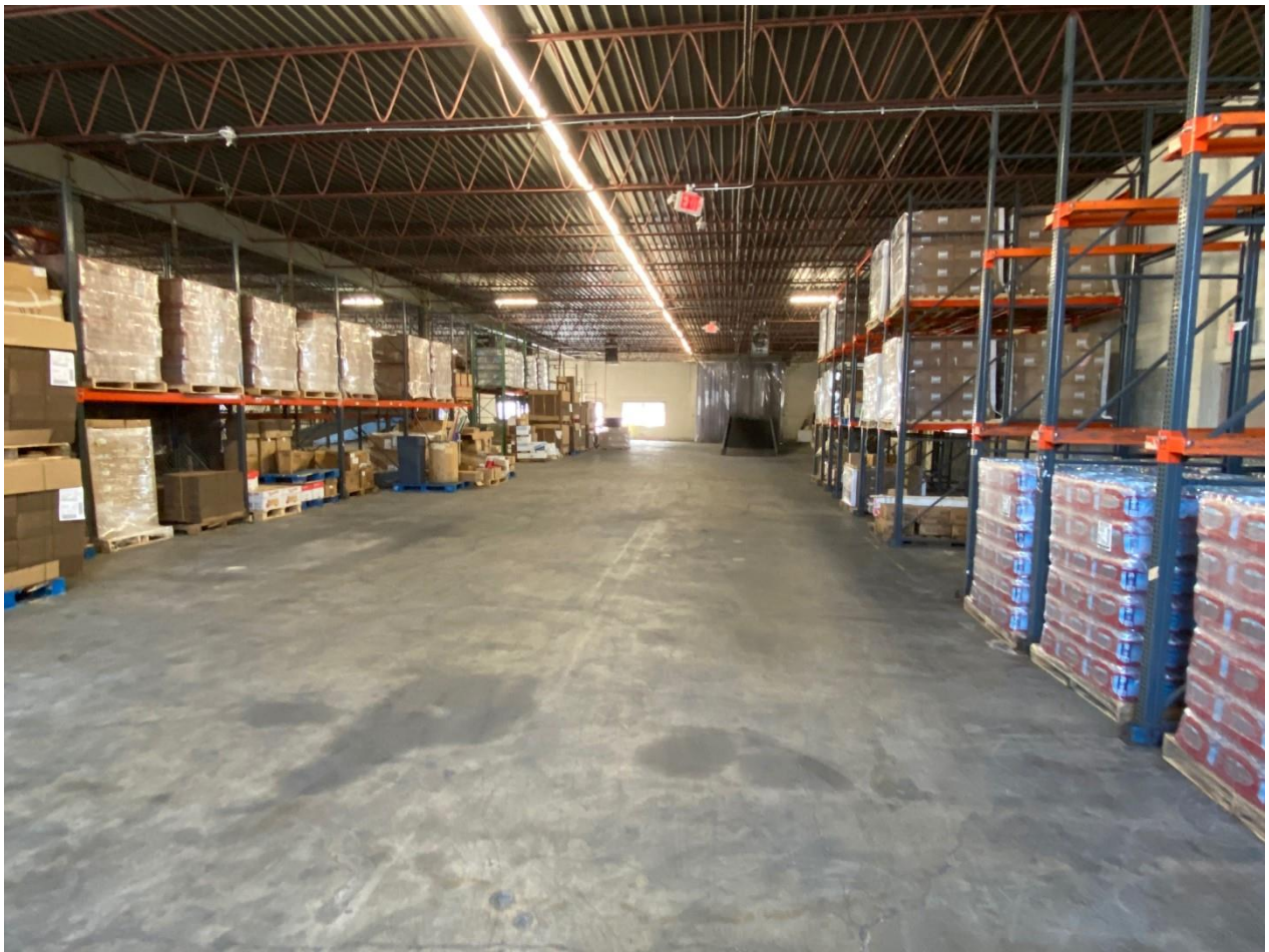
Image of portable loading dock accessed from Drive-in door