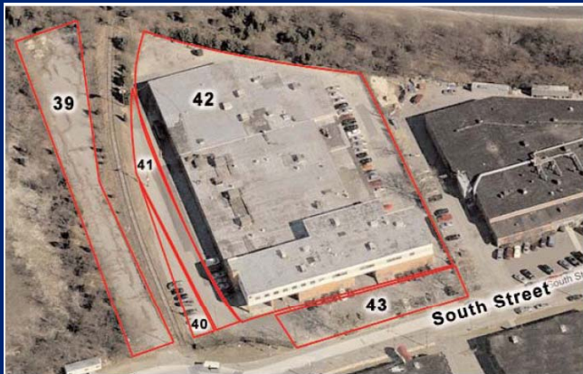
Section: 44 Block: 077 Lot s: 39-43