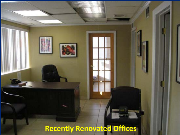
Recently Renovated Offices