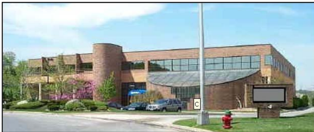
* Rendering *