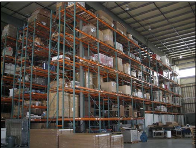
Narrow Aisle Racking