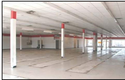
Interior - Main Floor