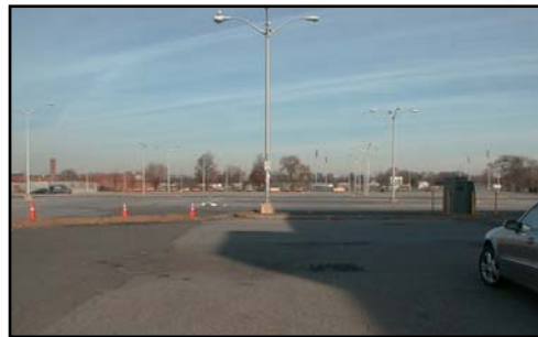
Rear Parking Lot