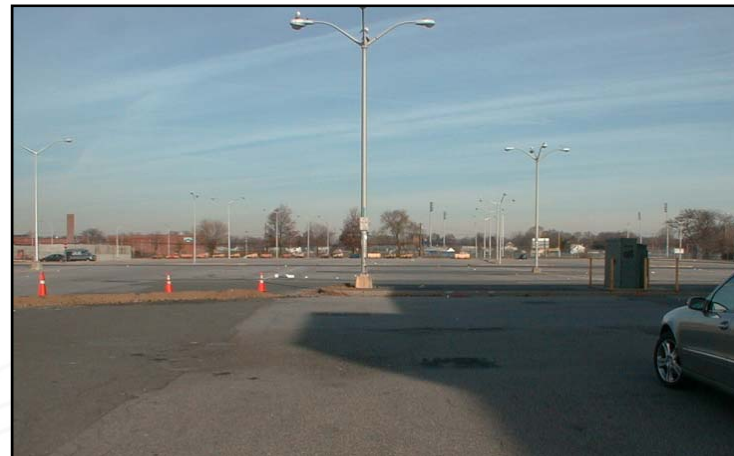
Rear Parking Lot