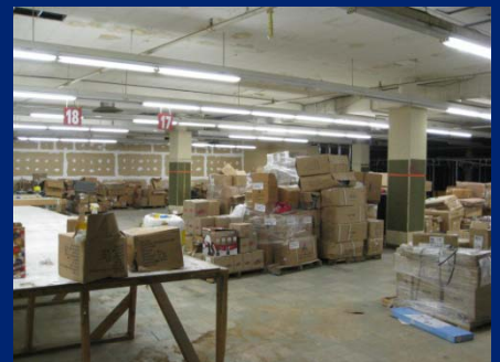
Flex Warehouse Space