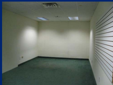
10 Private Offices