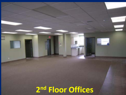
2 nd Floor Offices